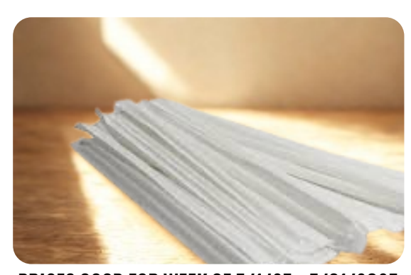
PRICES GOOD FOR WEEK OF 5/1/25 - 5/31/2025