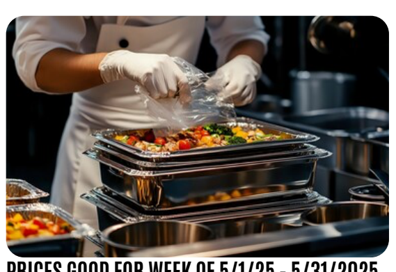
PRICES GOOD FOR WEEK OF 5/1/25 - 5/31/2025