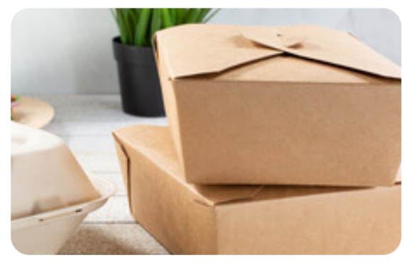
PRICES GOOD FOR WEEK OF 5/1/25 - 5/31/2025